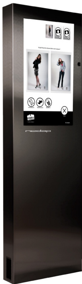
Tweet Mirror in glossy black acryl, wall mounted (# 9945814)