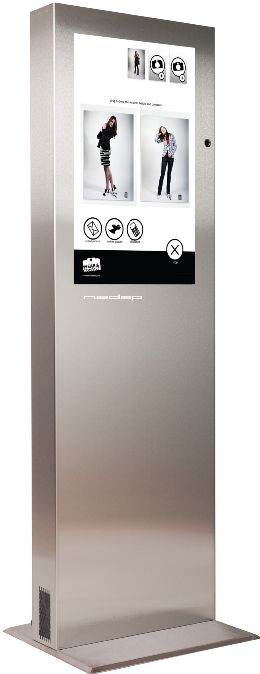
tweet mirror in stainless steel, stand alone (# 9945822)

THE AWARD-WINNING TWEET MIRROR IS A FUN TOOL THAT COMBINES SHOPPING WITH THE MOST MODERN COMMUNICATION TREND: SOCIAL NETWORKING. AS CUSTOMERS TRY ON YOUR FASHION PRODUCTS, THEY CAN USE THE TWEET MIRROR TO COMPARE THEIR OUTFIT AND SEND SNAPSHOTS OF THEMSELVES TO FRIENDS VIA TWITTER OR E-MAIL.